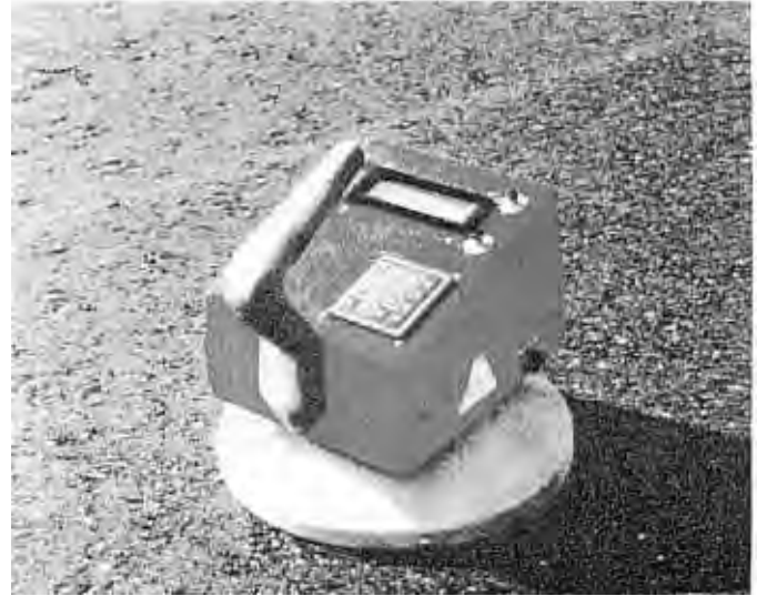
FIGURE 2 TransTech Systems PQI.

TransTech's marketing strategy has focused on the PQI as a process tool for the contractor to provide real-time feedback for improved asphalt laydown. This approach is producing an immediate improvement in the quality of asphalt highways while accumulating an extensive performance history that will be helpful in entering other market segments.