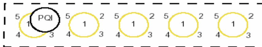
Figure B PQI Measurement Pattern